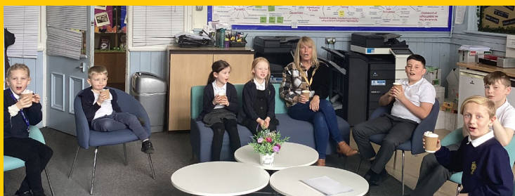
Hot Chocolate Fridays or Freezy Fridays in the summer term!

Our Year 5 children were lucky enough to have a theatre group come into school to deliver 'Looking for Callum' which is a hard-hitting production to support our PSHE curriculum.